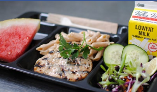
Asian Chicken Pasta