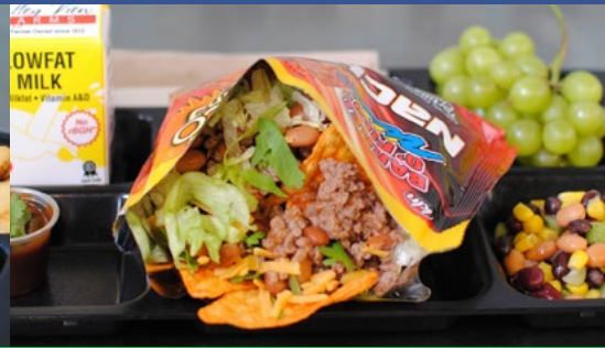
Walking Beef Taco